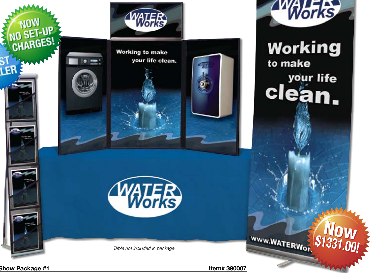
Table not included in package.