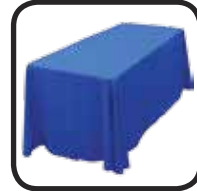
Standard Table Throws cover all 4 sides of the table

Quick Ship available See pages 5 and 7 in 2012 catalog for 24 and 48 Hour Lead Times