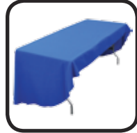
Economy Table Throws covers 3 sides of table with 9.5" overhang in back

Quick Ship available See pages 5 and 7 in 2012 catalog for 24 and 48 Hour Lead Times