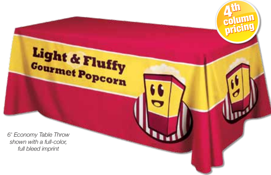
6' Economy Table Throw shown with a full-color, full bleed imprint