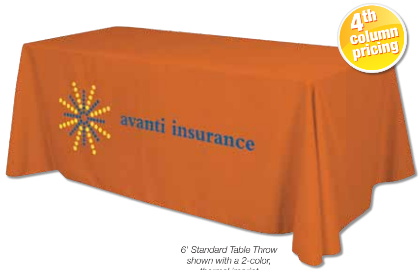
6' Standard Table Throw shown with a 2-color, thermal imprint