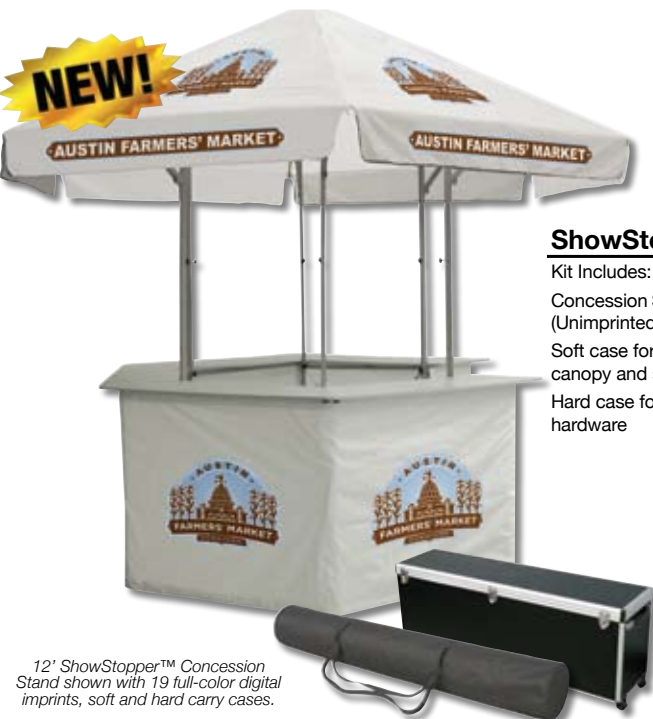
12' ShowStopper™ Concession Stand shown with 19 full-color digital imprints, soft and hard carry cases.