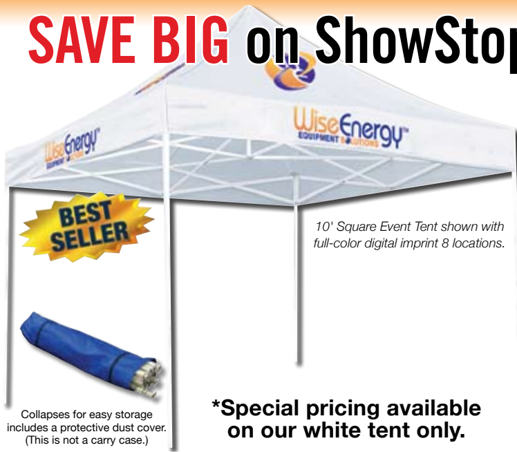
10' Square Event Tent shown with full-color digital imprint 8 locations.

*Special pricing available on our white tent only.